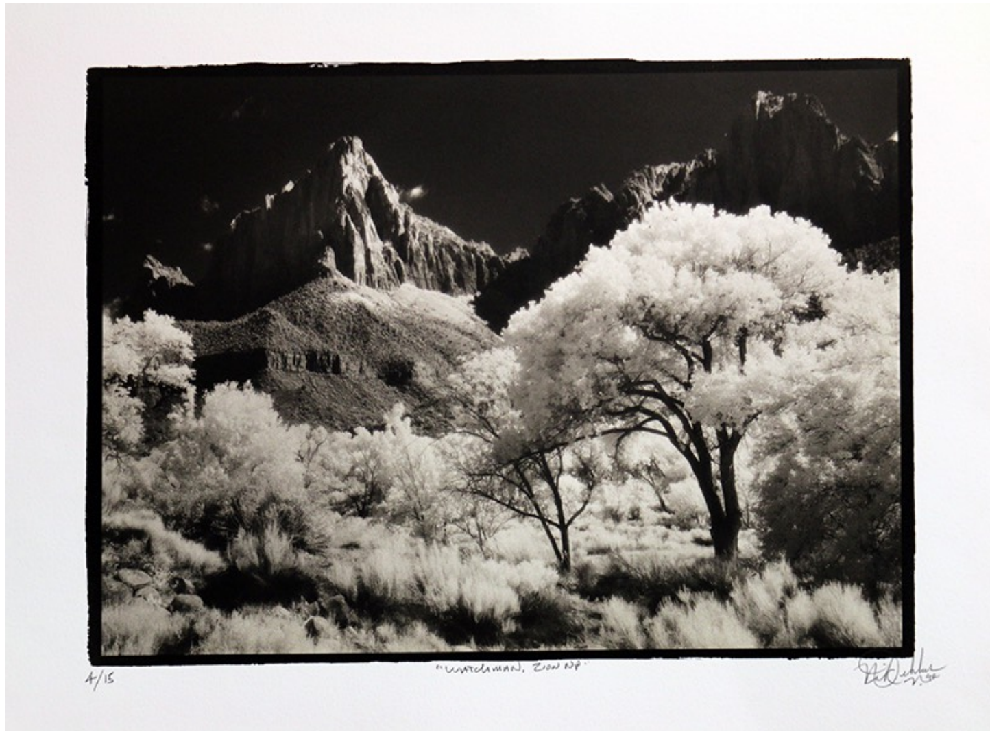
05 - Nick Dekker, Watchman / Zion 1992, Platinum Print, 2001, large size on 16x20" paper, signed and numbered