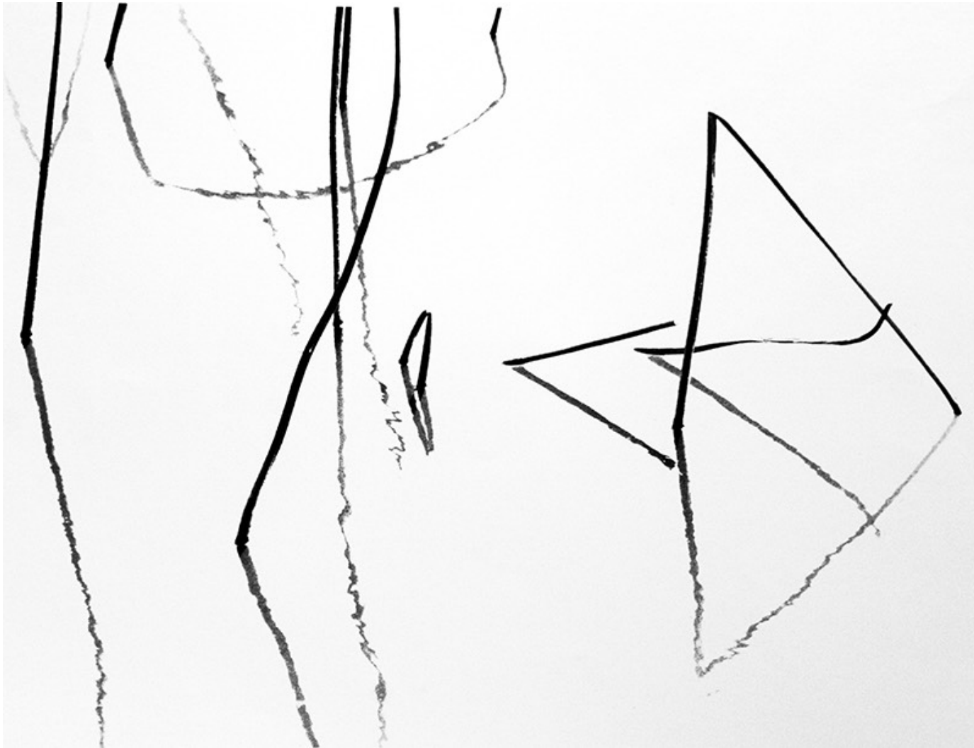
01 - Chi Kuo Chang - La Fleur Mourante, 1996, Silver Gelatin Print, 36x45cm on 40x50cm Ed 1/5 signed