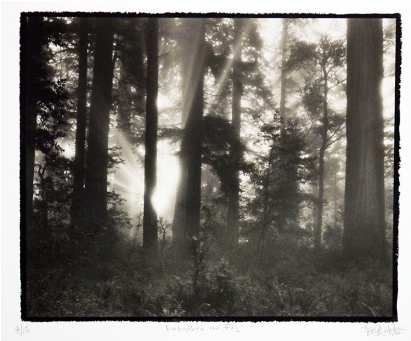
14 - Nick Dekker, Ladybird in Fog, Platinum Print, 2001, medium size on 16x20" paper, signed and numbered