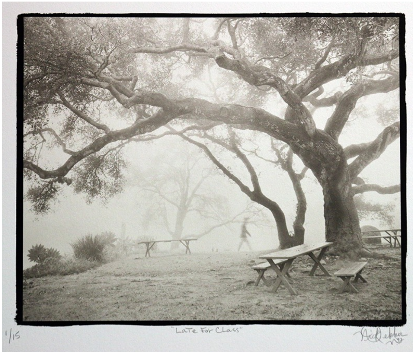
29 - Nick Dekker, Late For Class, 1997, Platinum Print, 2001, small size on 16x20" paper, signed and numbered