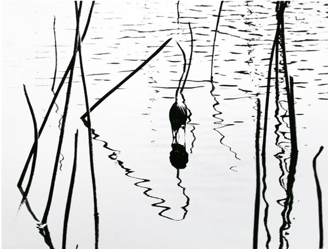
06 - Chi Kuo Chang - La Fleur Mourante, 1990-s, Silver Gelatin Print, 36x45cm on 40x50cm, not signed