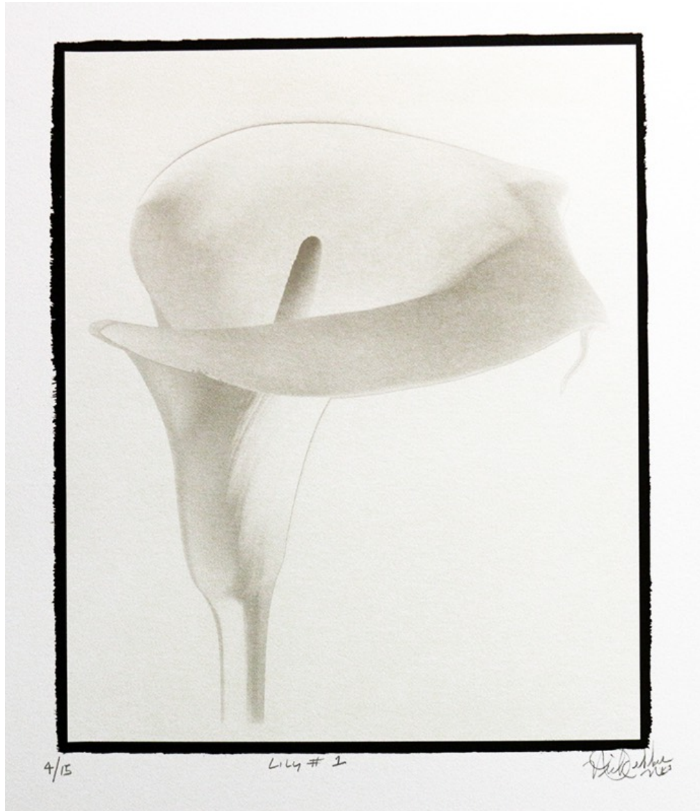
01 - Nick Dekker , Lily I, Platinum Print, 2001, medium size on 20x16" paper, signed and numbered