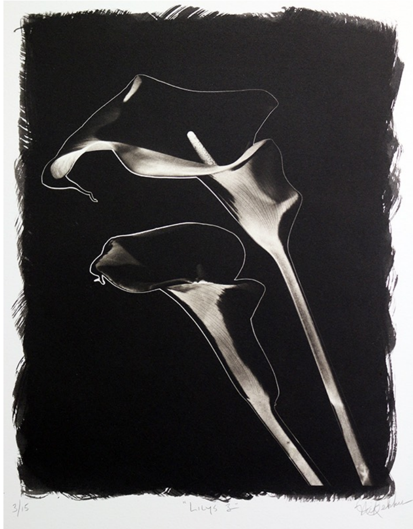
28 - Nick Dekker, Lily 03, 1992, Platinum Print, 2001, medium size on 20x16" paper, signed and numbered