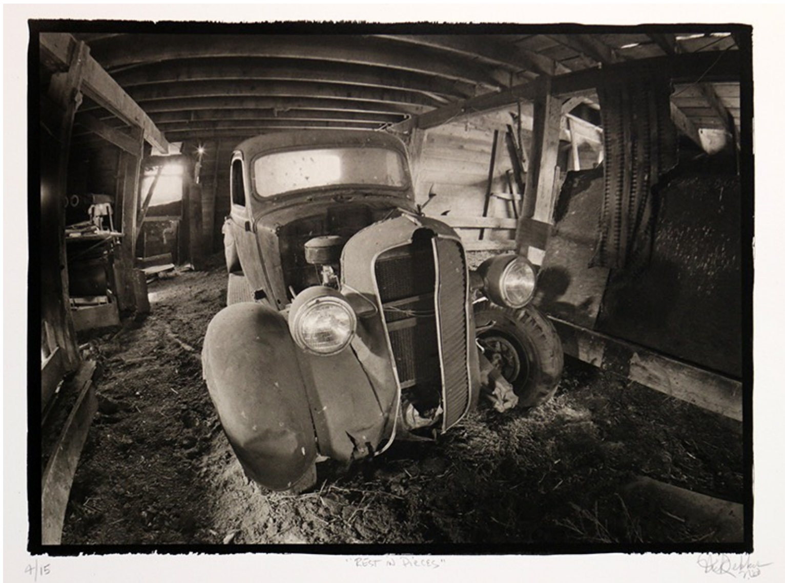
22 - Nick Dekker, Rest in Pieces, Platinum Print, 2001, large size on 16x20" paper, signed and numbered