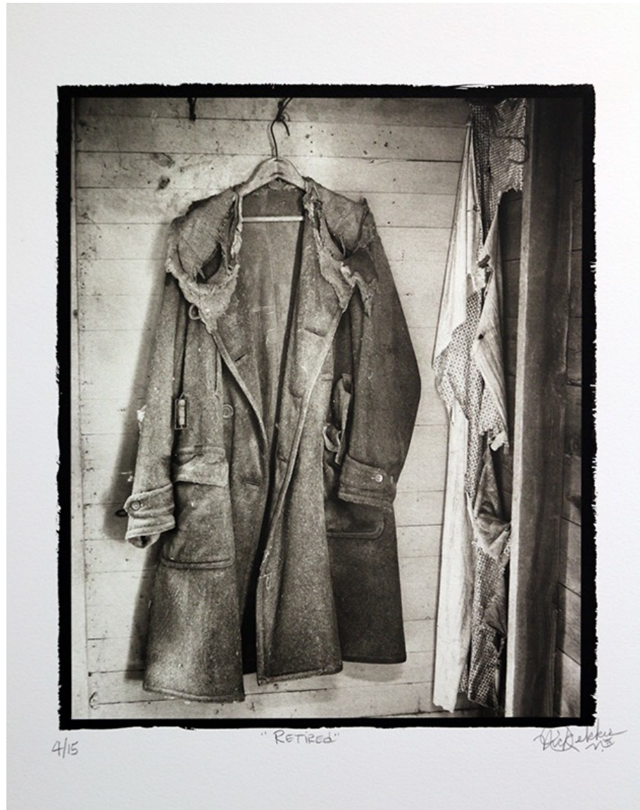
10 - Nick Dekker, Retired 1995, Platinum Print, 2001, medium size on 20x16" paper, signed and numbered