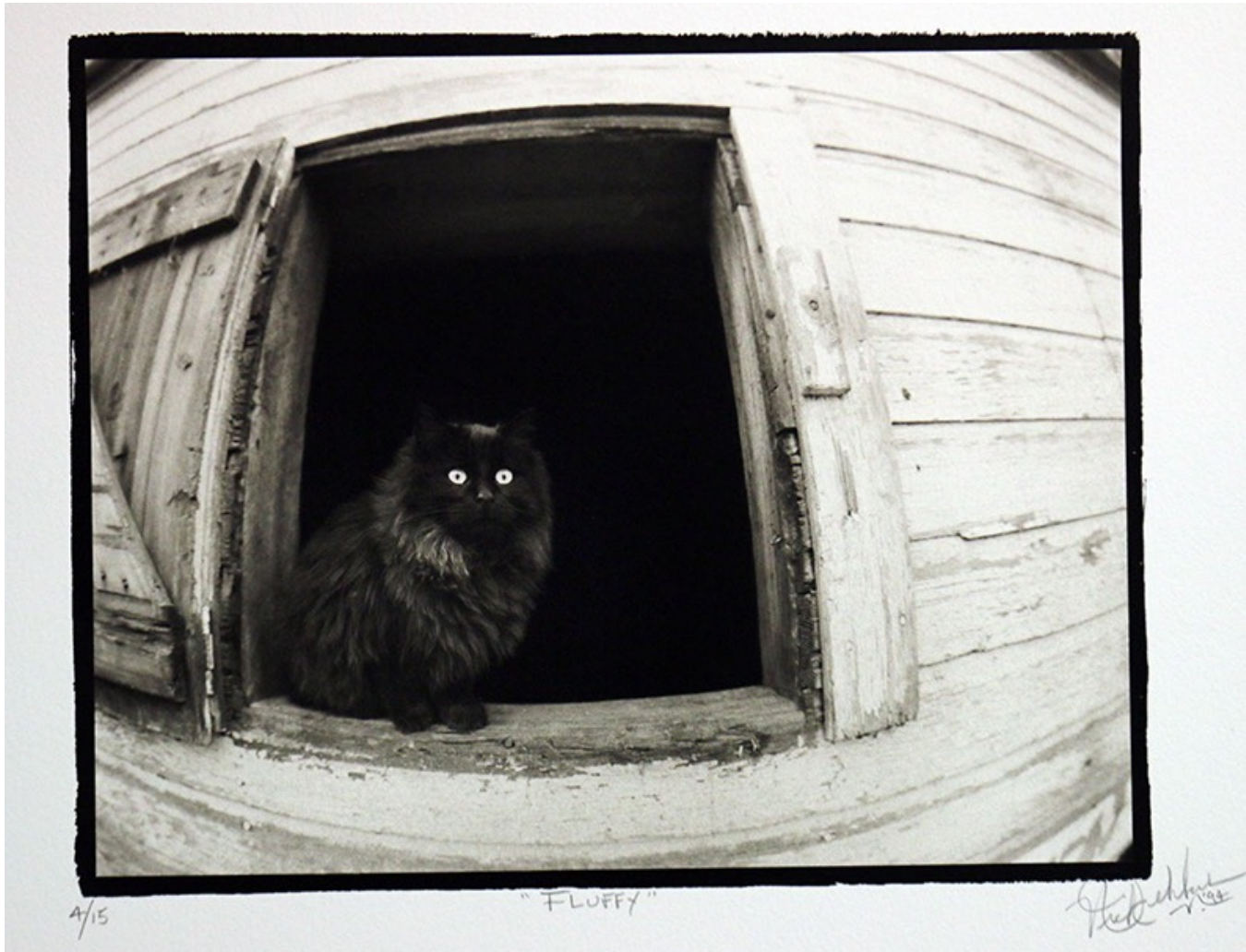
17 - Nick Dekker, Flurry 1994, Platinum Print, 2001, small size on 16x20" paper, signed and numbered