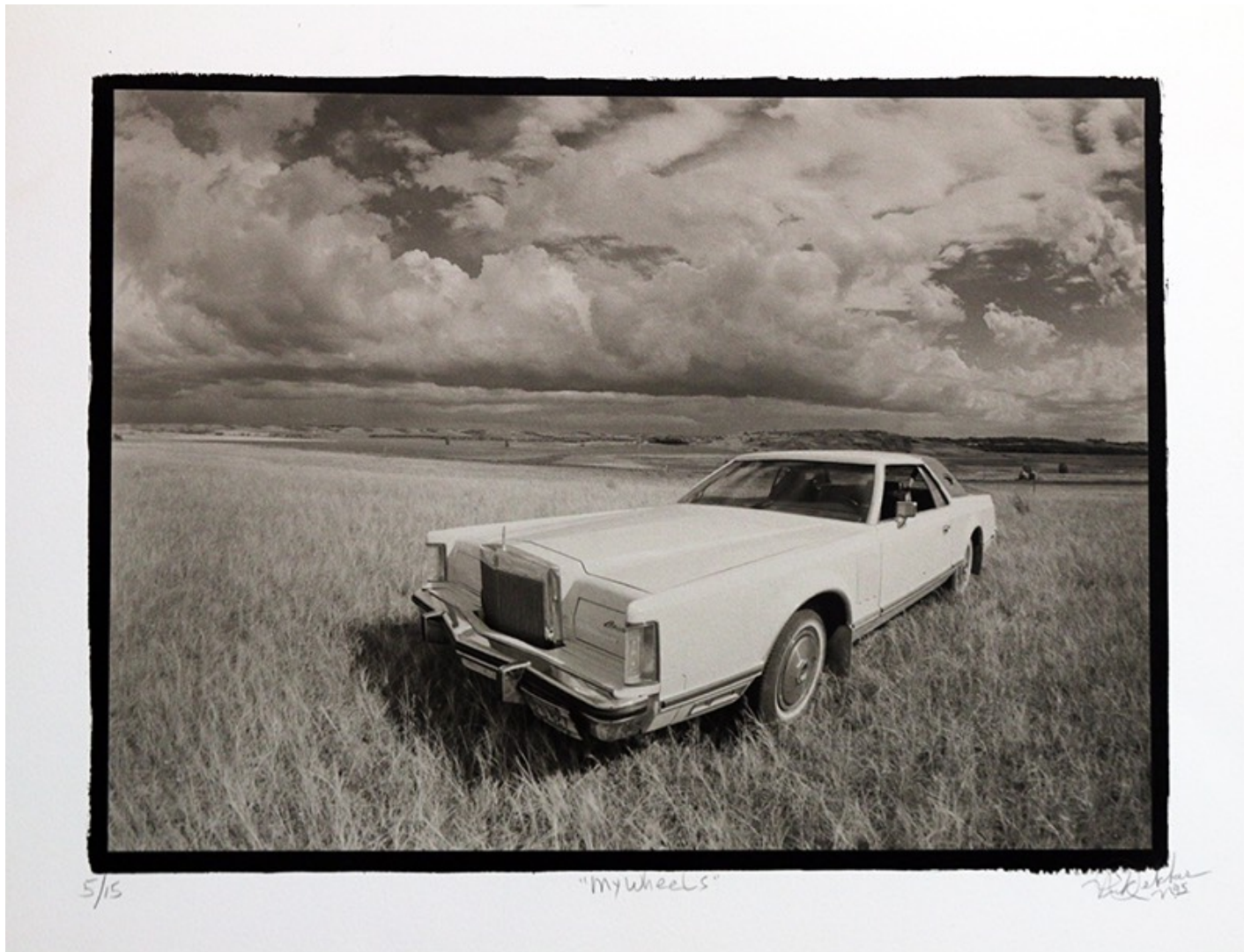
03 - Nick Dekker , My Car 1995, Platinum Print, 2001, large size on 16x20" paper, signed and numbered