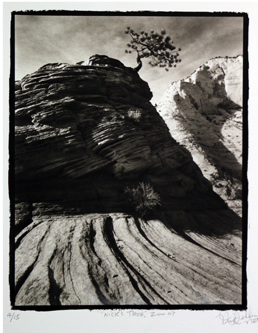
16 - Nick Dekker, Nick's Tree 1987, Platinum Print, 2001, small size on 20x16" paper, signed and numbered