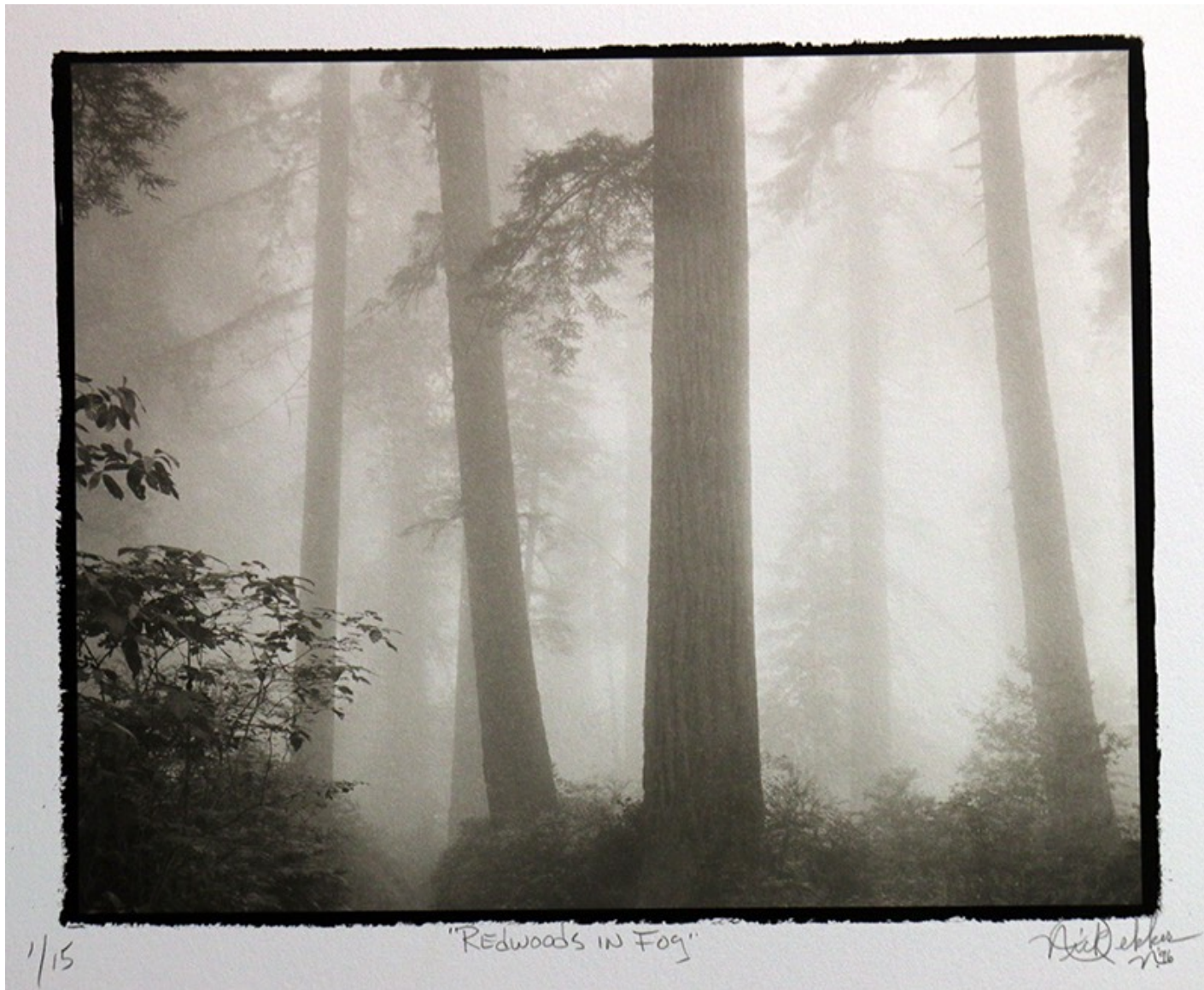
33 - Nick Dekker, Redwoods in Fog 1996, Platinum Print, 2001, medium size on 16x20" paper, signed and numbered