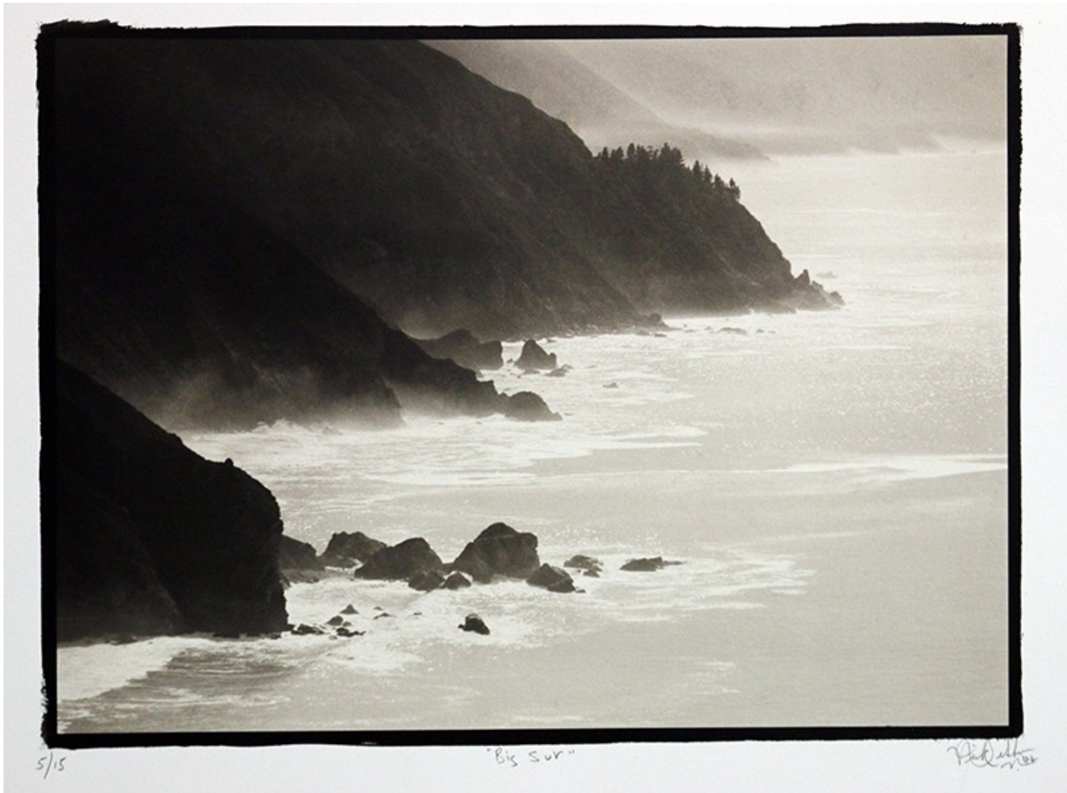
25 - Nick Dekker, Big Sur, Platinum Print, 2001, large size on 16x20" paper, signed and numbered