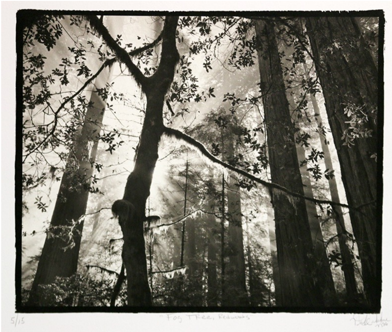
15 - Nick Dekker, Fog in Redwood Trees 1996, Platinum Print, 2001, medium size on 16x20" paper, signed and numbered