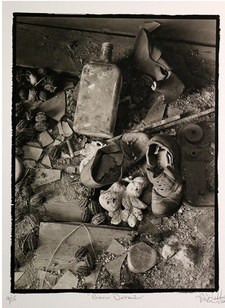
21 - Nick Dekker, Barn Detail 1986, Platinum Print, 2001, large size on 20x16" paper, signed and numbered