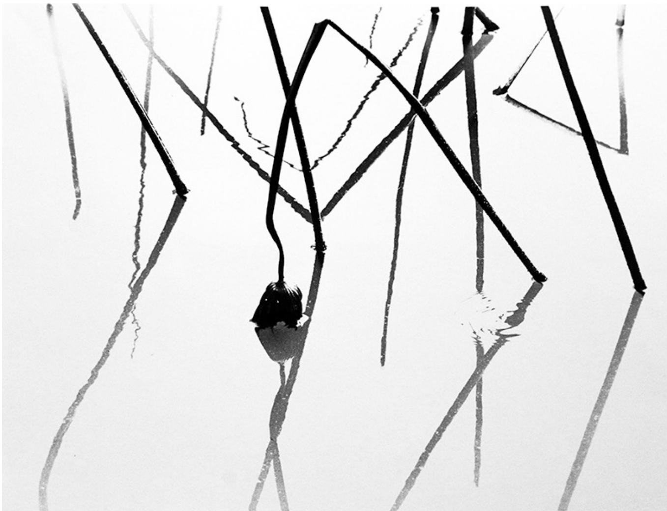
02 - Chi Kuo Chang - La Fleur Mourante, 1994, Silver Gelatin Print, 36x45cm on 40x50cm, Ed 1/5, signed