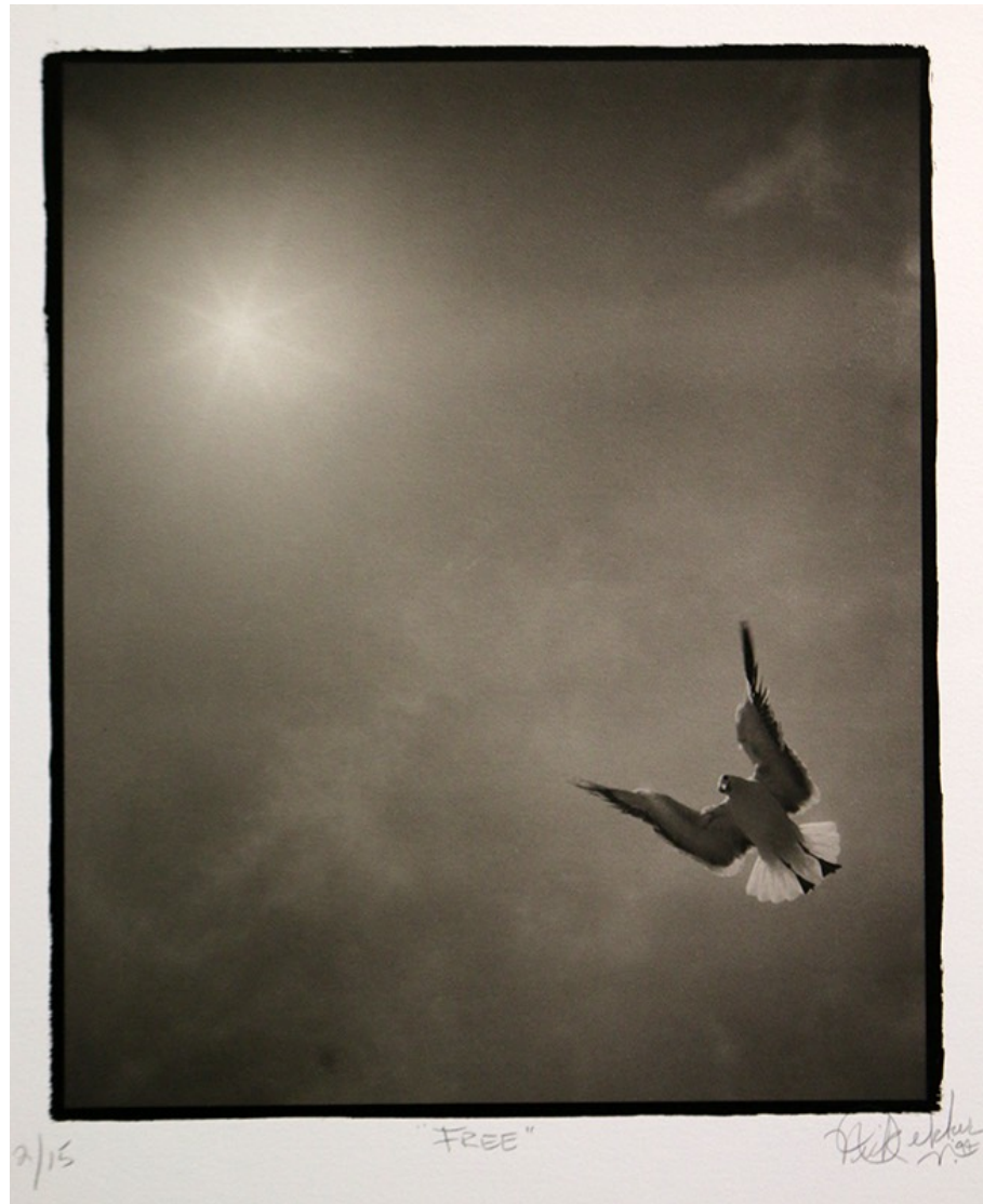
34 - Nick Dekker, Free 1997, Platinum Print, 2001, medium size on 20x16" paper, signed and numbered