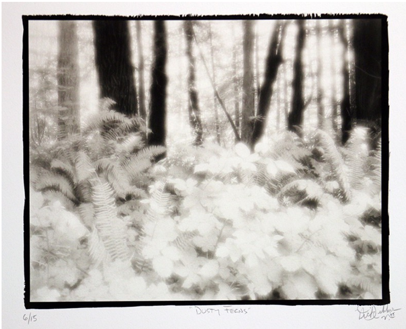
11 - Nick Dekker, Dusty Ferns, 1995, Platinum Print, 2001, medium size on 16x20" paper, signed and numbered