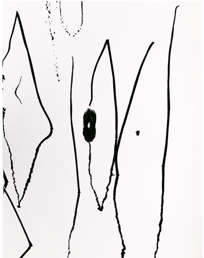
09 and 10 - Chi Kuo Chang - La Fleur Mourante, 1990-s, Silver Gelatin Print, 45x36cm on 50x40cm, not signed