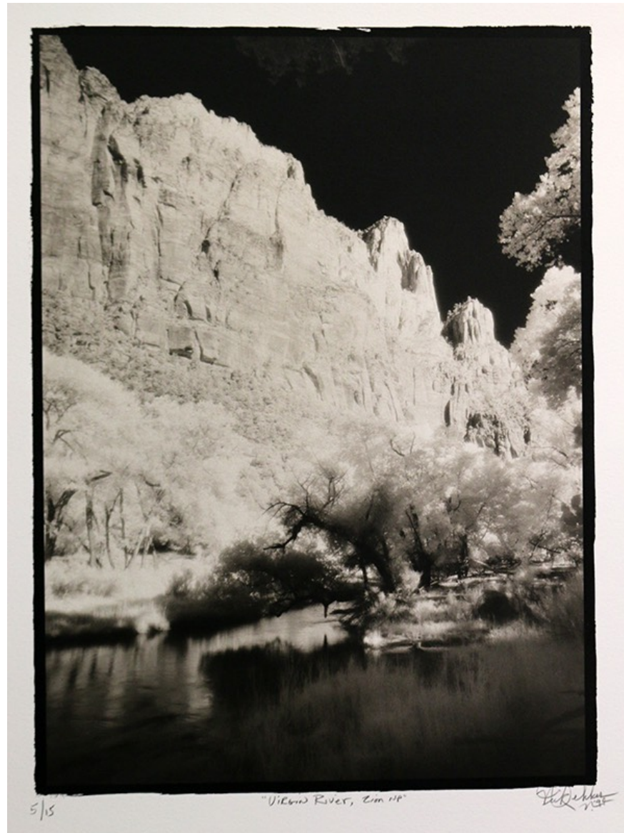
19 - Nick Dekker, Virgin River 1994, Platinum Print, 2001, large size on 20x16" paper, signed and numbered