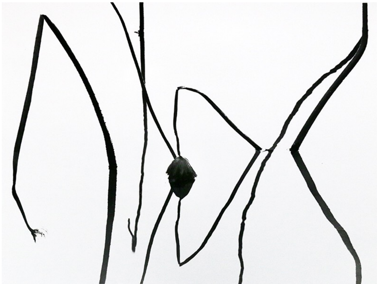
08 - Chi Kuo Chang - La Fleur Mourante, 1990-s, Silver Gelatin Print, 36x45cm on 40x50cm, not signed