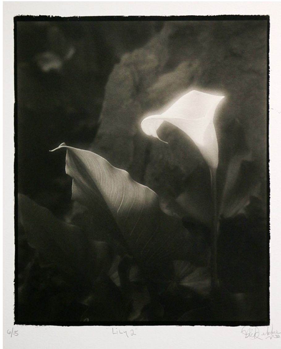
26 - Nick Dekker, Lily 02, 1992, Platinum Print, 2001, medium size on 20x16" paper, signed and numbered