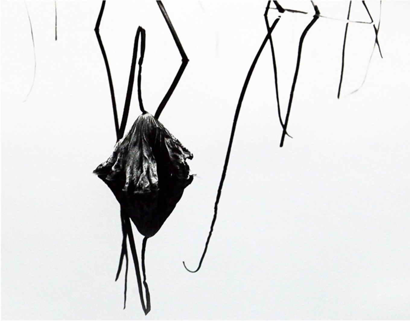
04 - Chi Kuo Chang - La Fleur Mourante, 1995, Silver Gelatin Print, 36x45cm on 40x50cm, Ed 1/5, signed