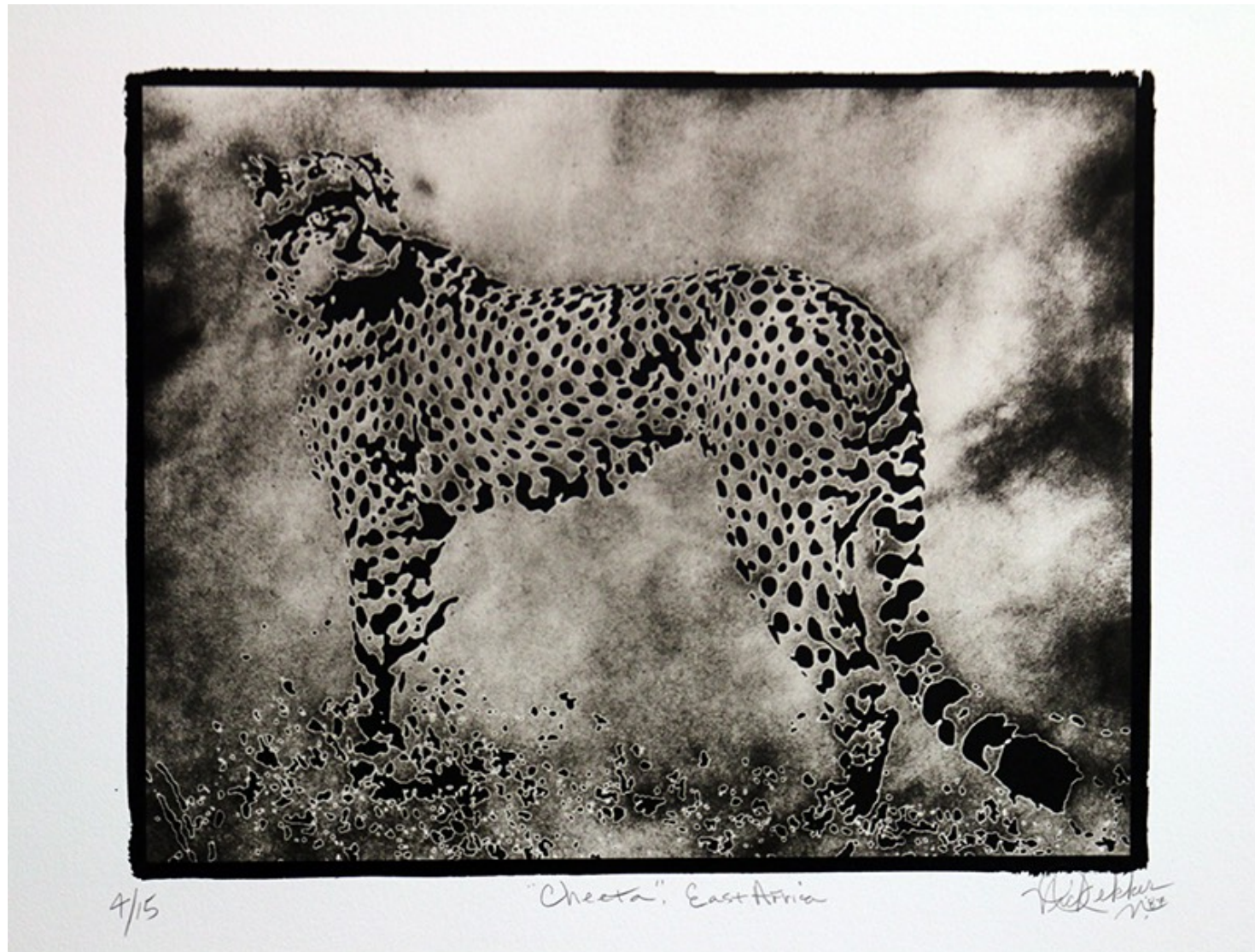
08 - Nick Dekker, Cheetah 1988, Platinum Print, 2001, medium size on 16x20" paper, signed and numbered