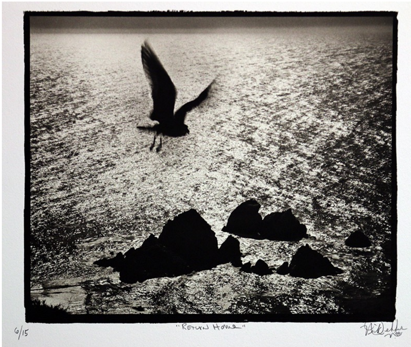
32 - Nick Dekker, Return Home 1994, Platinum Print, 2001, medium size on 16x20" paper, signed and numbered