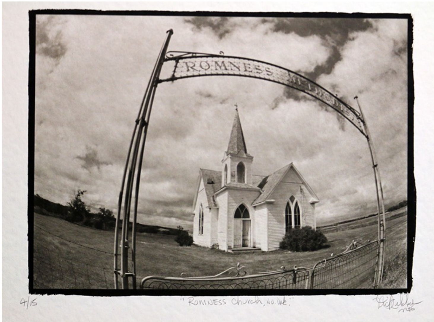
07 - Nick Dekker , Romness Church, ND, 1995, Platinum Print, 2001, large size on 16x20" paper, signed and numbered