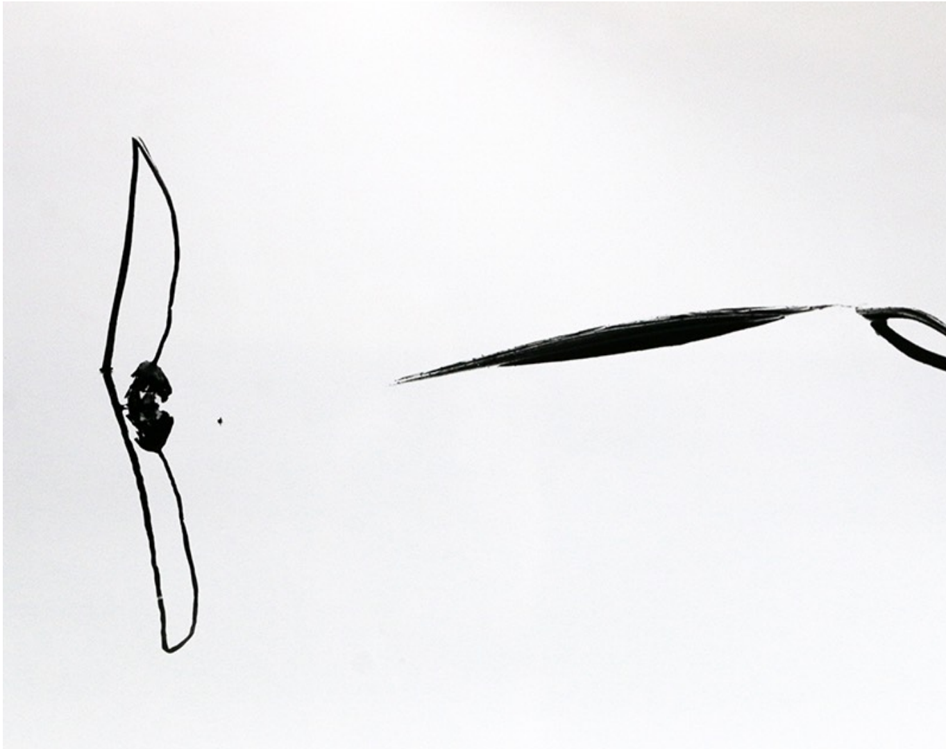
03 - Chi Kuo Chang - La Fleur Mourante, 1990-s, Silver Gelatin Print, 36x45cm on 40x50cm, not signed