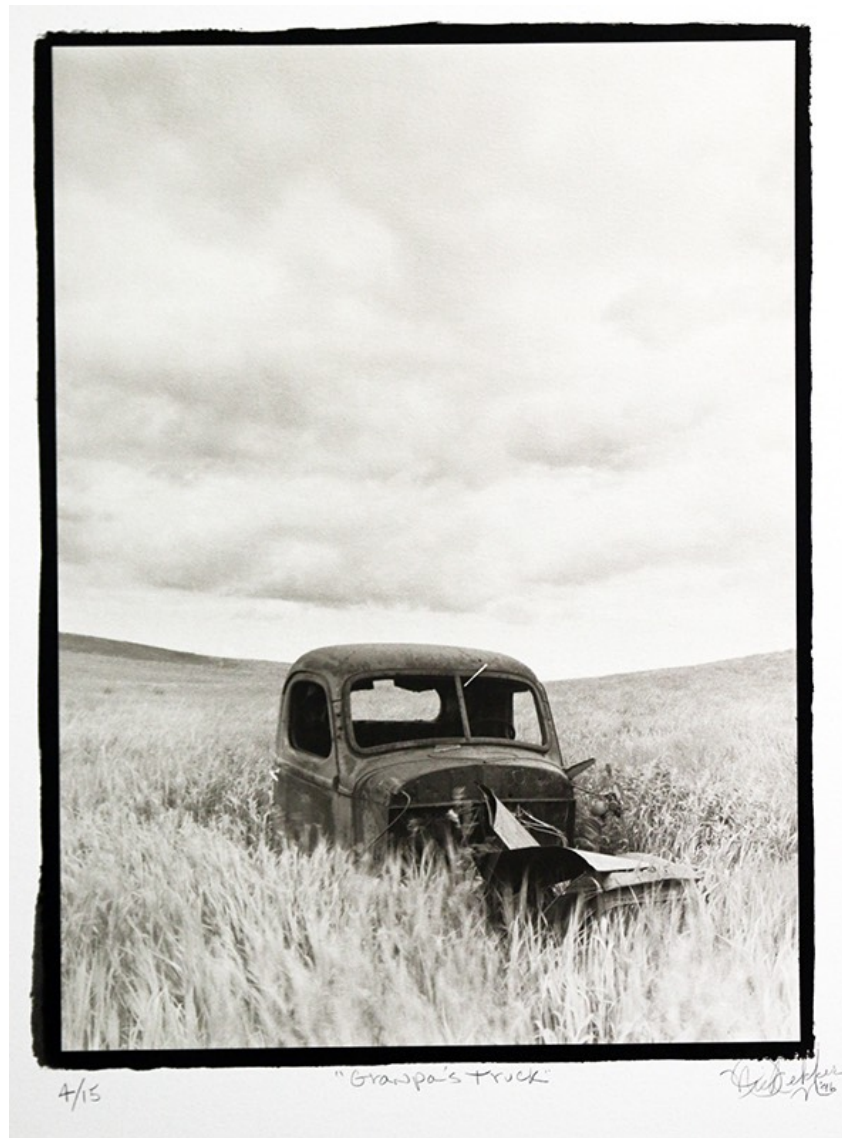
18 - Nick Dekker, Grandpa's Truck 1996, Platinum Print, 2001, large size on 20x16" paper, signed and numbered