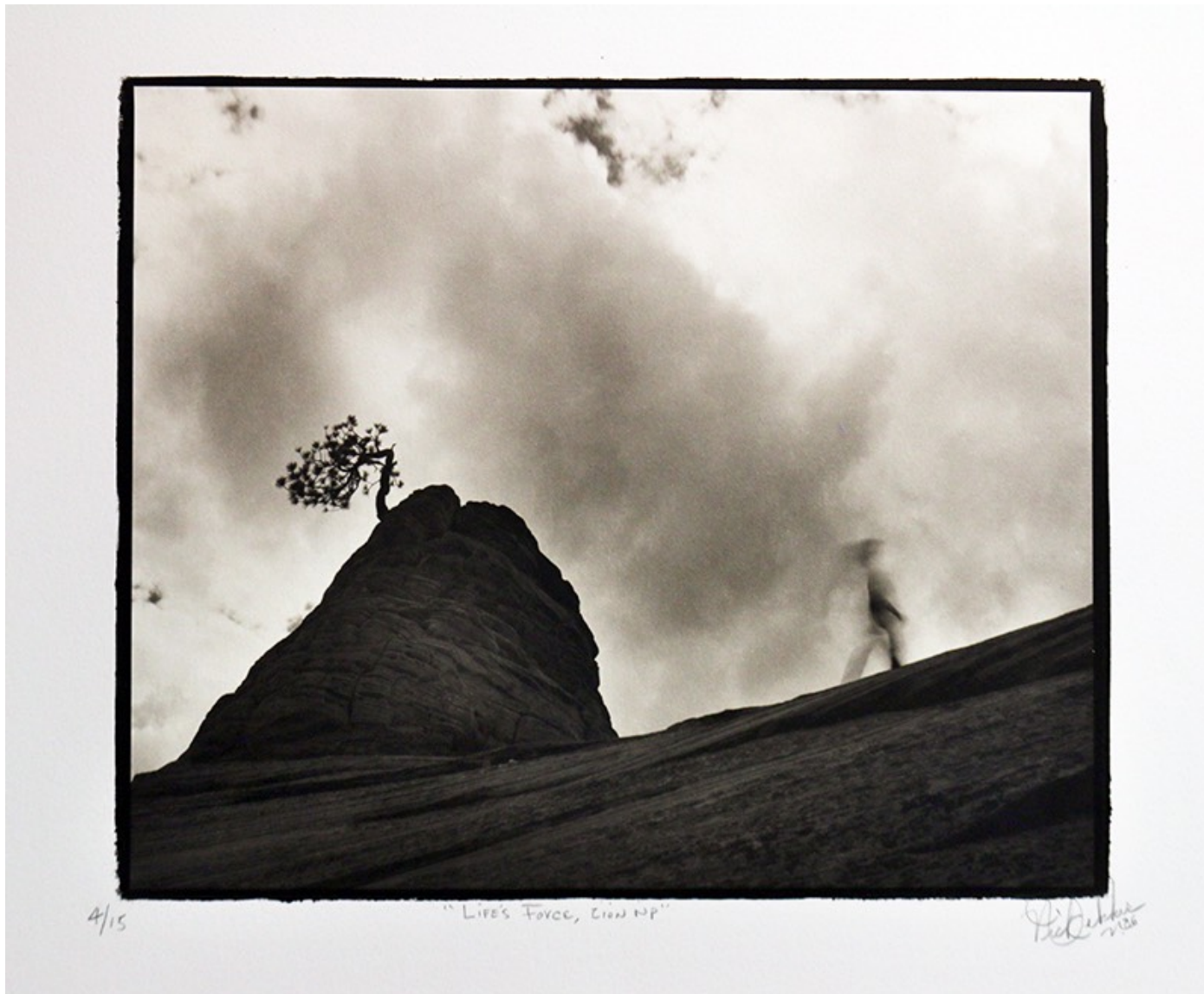
02 - Nick Dekker, Life's Forces, Platinum Print, 2001, medium size on 16x20" paper, signed and numbered