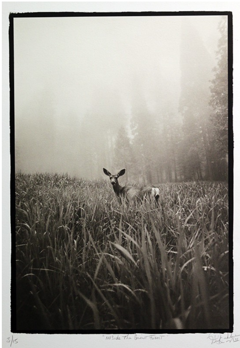
35 - Nick Dekker , Inside the Giant Forest 1995, Platinum Print, 2001, large size on 20x16" paper, signed and numbered