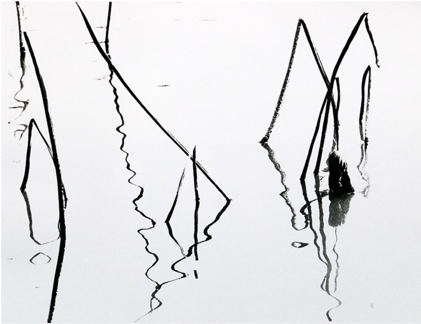
05 - Chi Kuo Chang - La Fleur Mourante, 1995, Silver Gelatin Print, 36x45cm on 40x50cm, ED 1/5 , signed