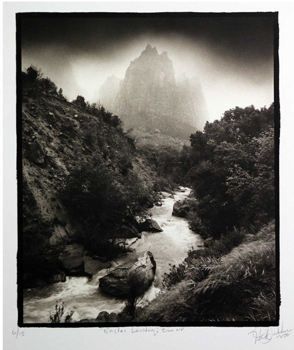
27 - Nick Dekker, Eagle's landing 1994, Platinum Print, 2001, medium size on 20x16" paper, signed and numbered