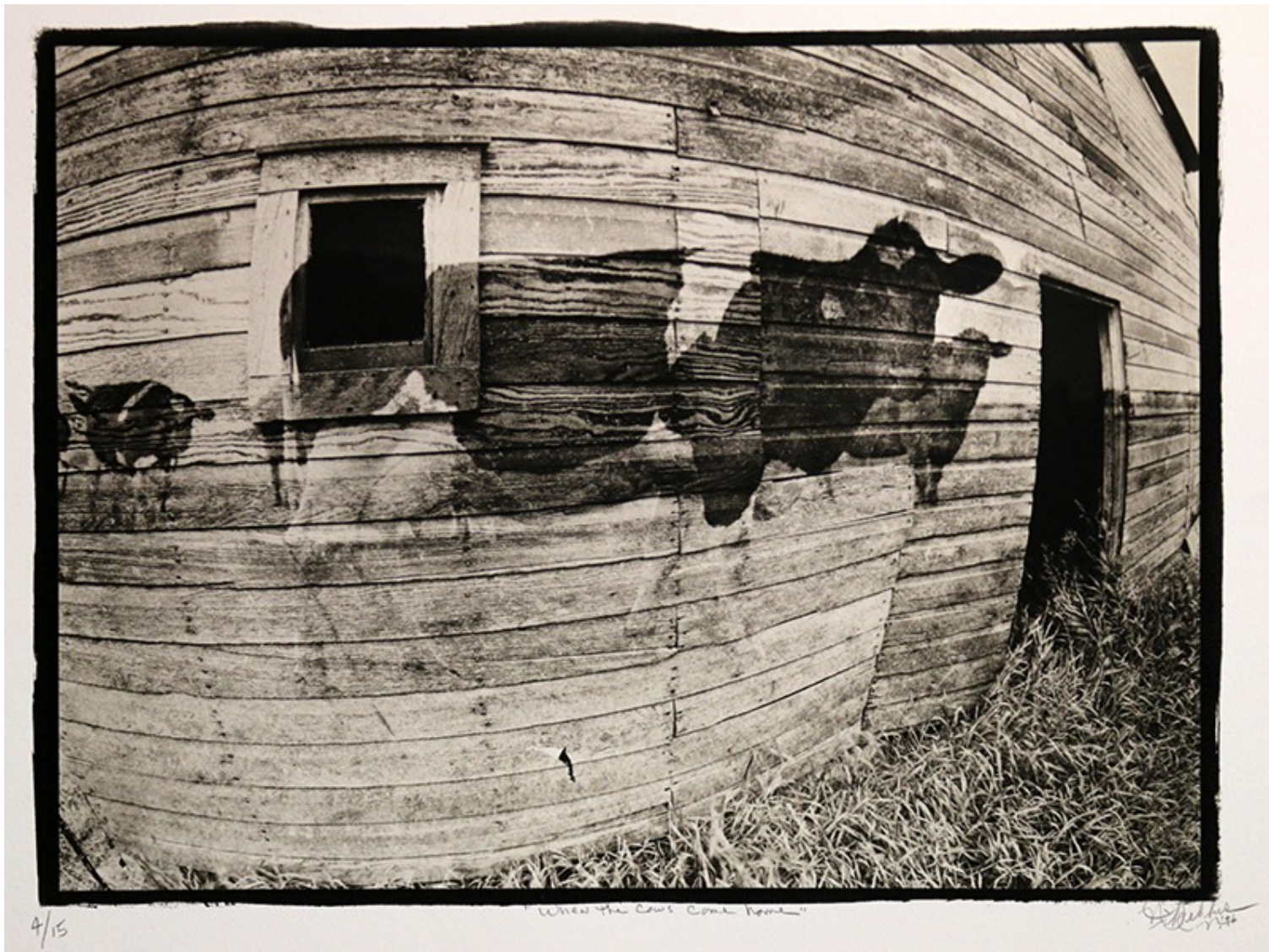
4/15 When the cows come home! Nick Dekker 2001 23 - Nick Dekker, When the cows come home 1996, Platinum Print, 2001, large size on 16x20" paper, signed and numbered