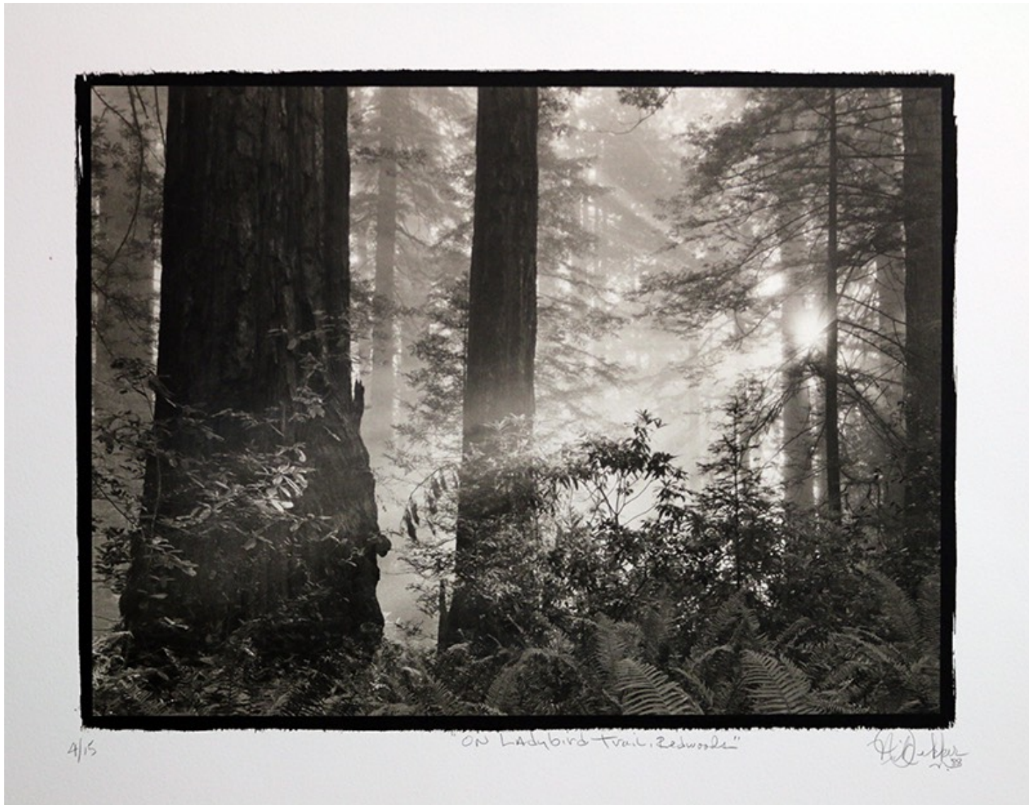
06 - Nick Dekker, On Ladybird Trail 1988, Platinum Print, 2001, large size on 16x20" paper, signed and numbered