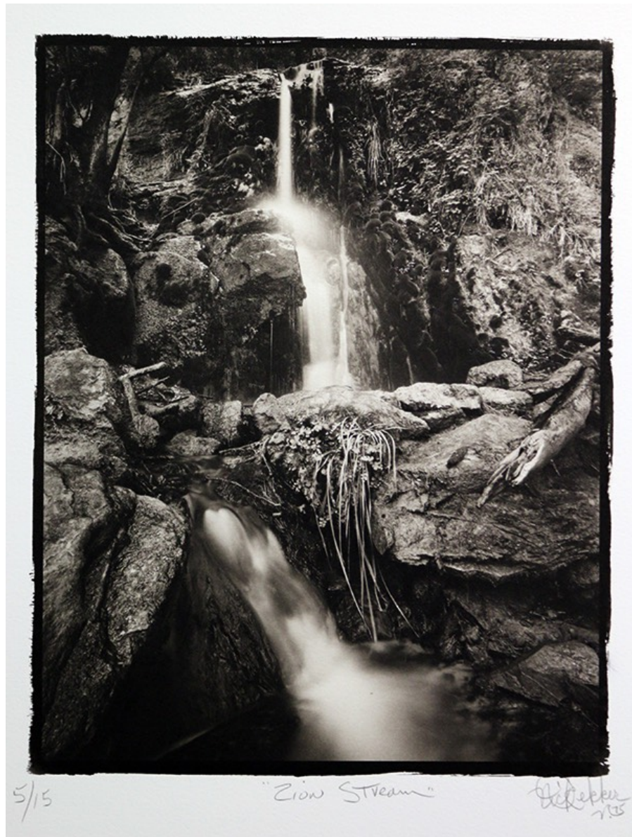
13 - Nick Dekker, Zion Stream 1975, Platinum Print, 2001, medium size on 20x16" paper, signed and numbered