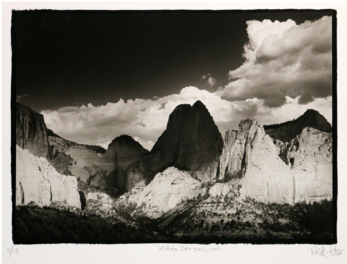
20 - Nick Dekker, Kolob Canyons 1996, Platinum Print, 2001, large size on 16x20" paper, signed and numbered