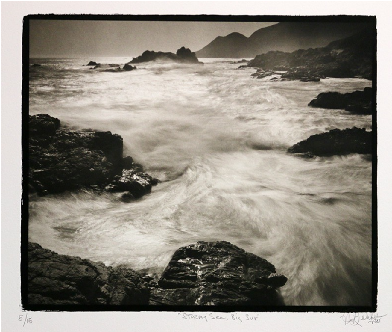
12 - Nick Dekker, Stormy Sea, Big Sur, CA 1995, Platinum Print, 2001, medium size on 16x20" paper, signed and numbered