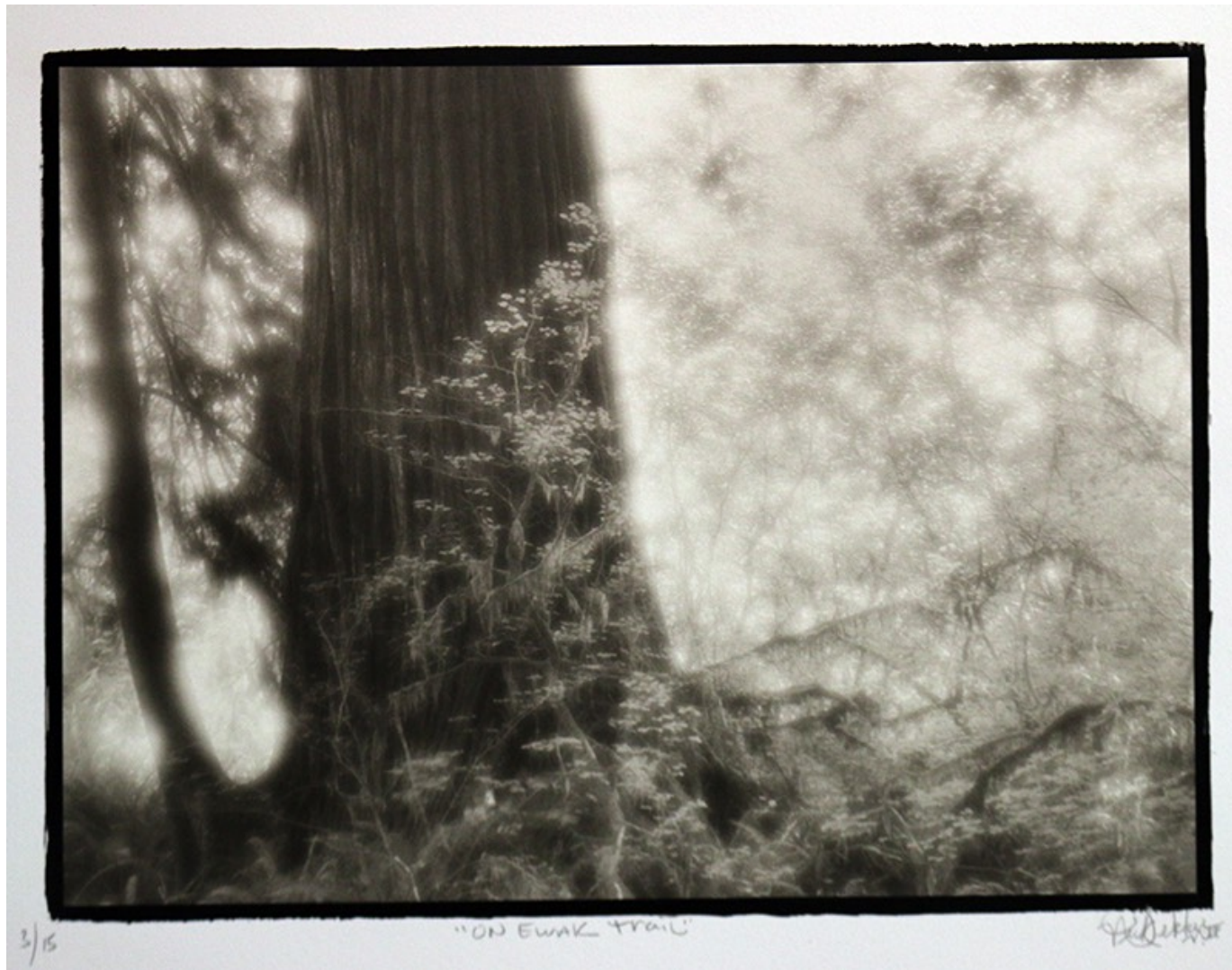
30 - Nick Dekker, On Ewak Trail, Platinum Print, 2001, medium size on 16x20" paper, signed and numbered