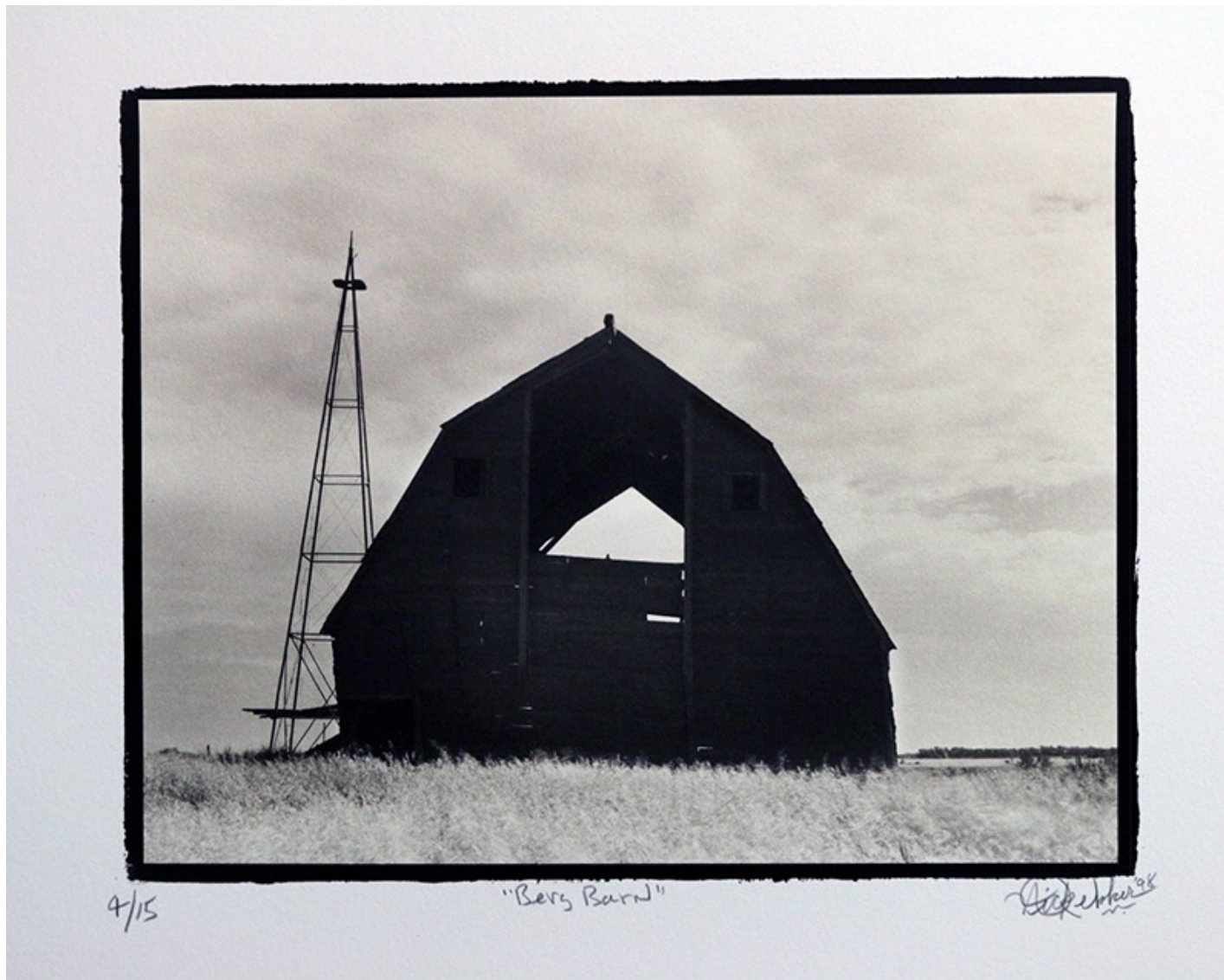
04 - Nick Dekker, Berg Barn 1998, Platinum Print, 2001, small size on 16x20" paper, signed and numbered