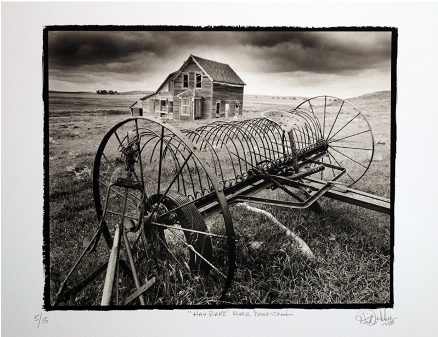
09 - Nick Dekker, Hay Rake, River Homestead, 1995, Platinum Print, 2001, medium size on 16x20" paper, signed and numbered